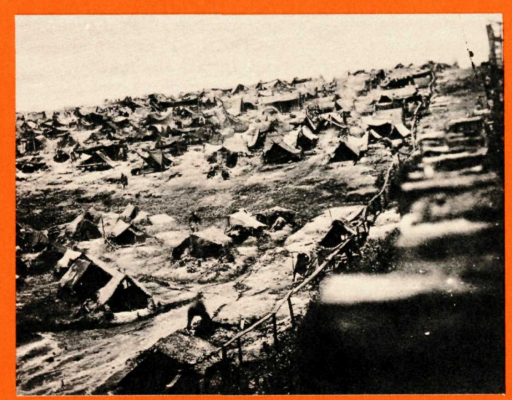
Huts built on the "deadline," August 1864, looking northeast from a "Pigeon-Roost" atop the stockade. Note the "deadline" at right.