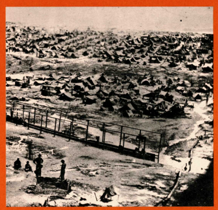
Andersonville, August 1864, looking northwest across the enclosure from a point on the stockade southeast of the sinks.