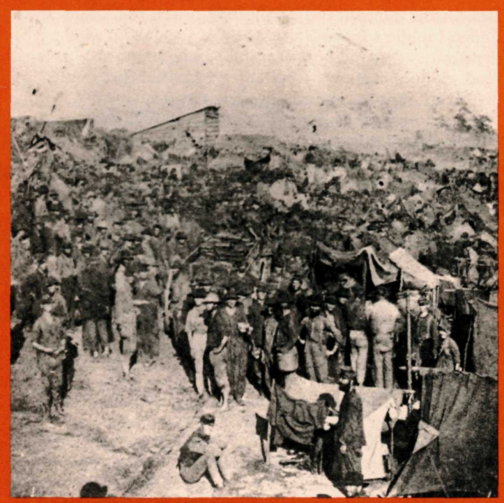
Issuing rations to 33,000 prisoners, August 1864. This photograph was probably taken near the North Gate on Market Street.