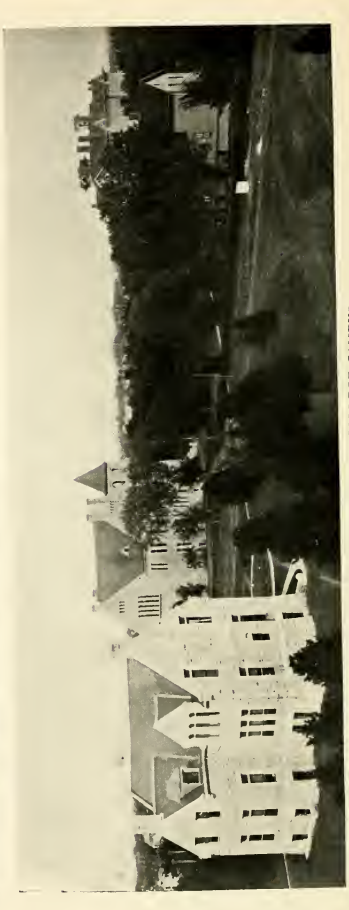
VIEW OF A PORTION OF THE COLLEGE CAMPUS