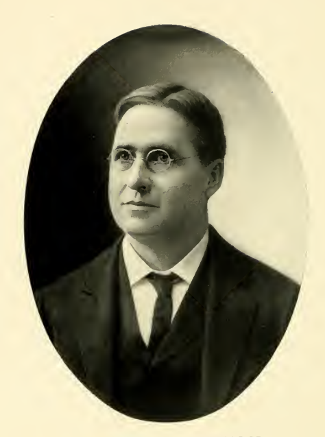
HON. WINFIELD AUSTIN SCOTT BIRD