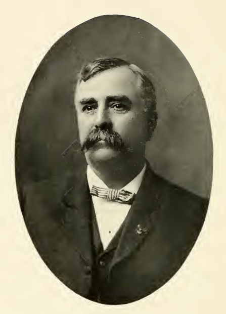
HON. JOSEPH BENJAMIN BURTON BETTS