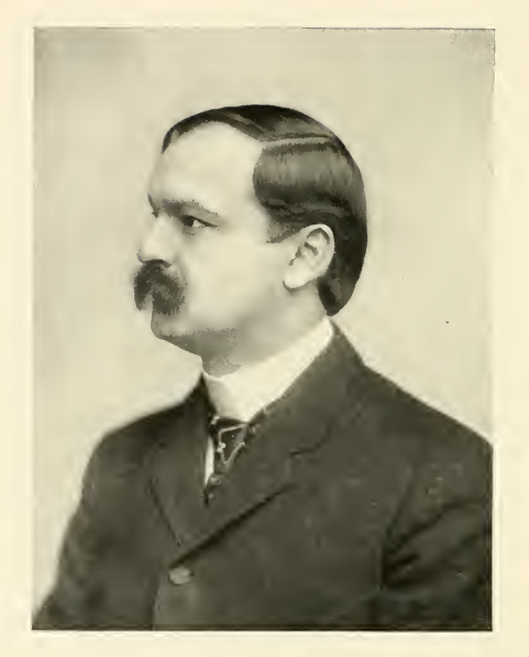
HON. CHARLES CURTIS