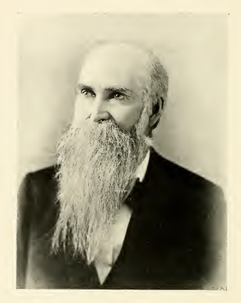
HON. DANIEL MULFORD VALENTINE